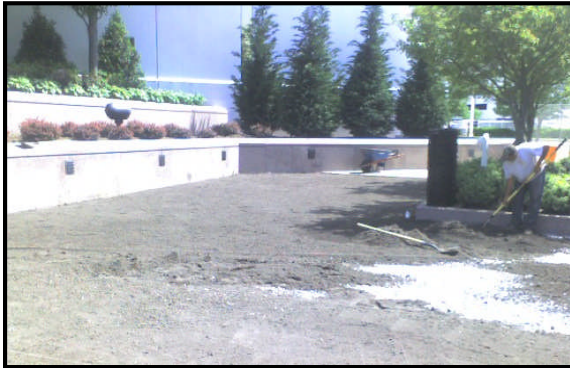
Placement of the 6" of 2A material has been completed and the area is ready for EZ Roll.