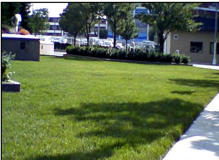
After sod placement the area is available for use and accessible to the public.