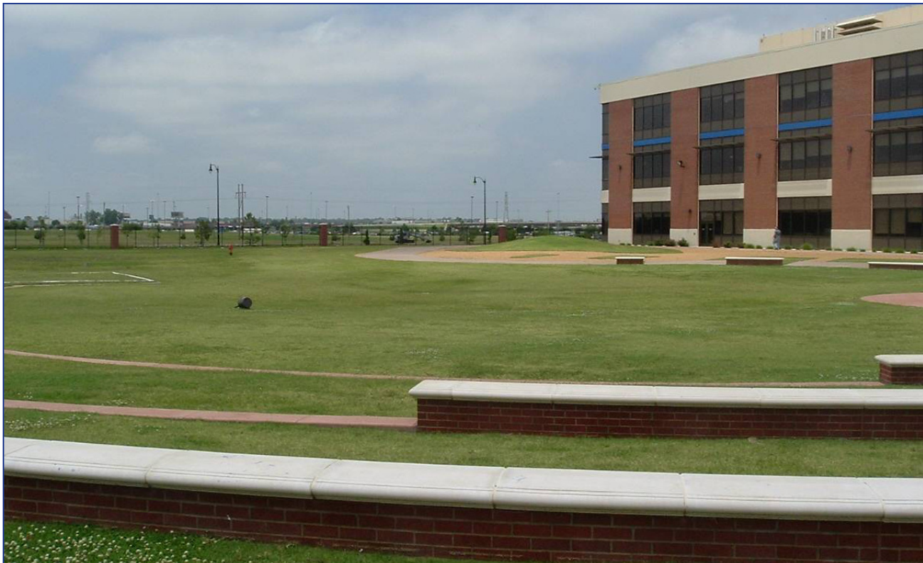
Above: Dell's Oklahoma City Campus with EZ Roll Grass Paver in 2009