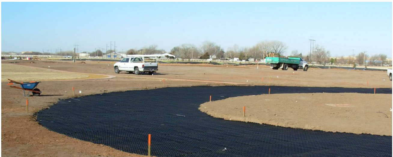
EZ Roll Paver will provide a stable surface for emergency vehicles as they approach the center.