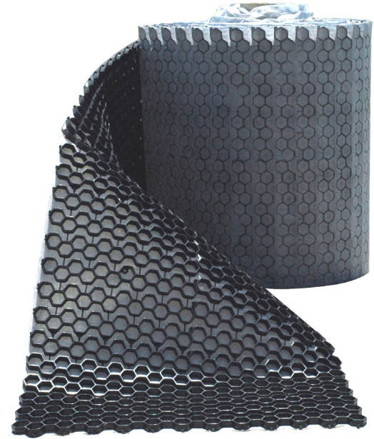
EZ Roll™ Gravel Paver with geotextile fabric backing.