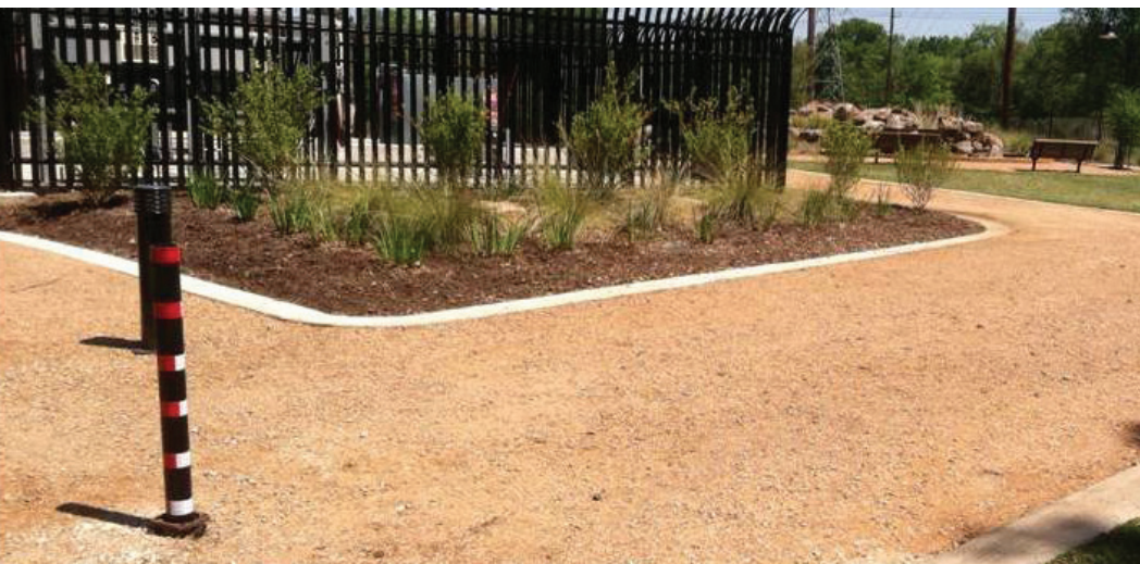
Above Right: Installed Paver Middle & Left: Installation 1 year later, June 2011