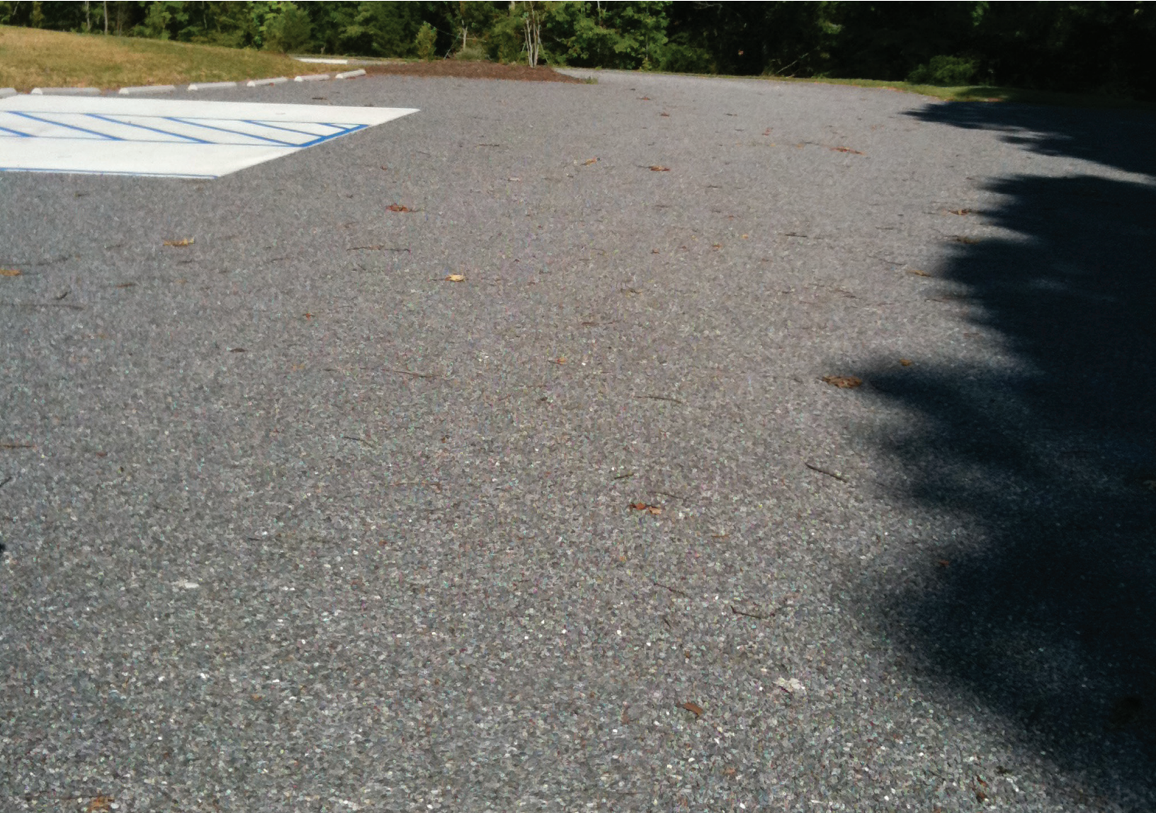
Above Right: Installed Paver. Above: Installation 1 year later, taken July 2011.