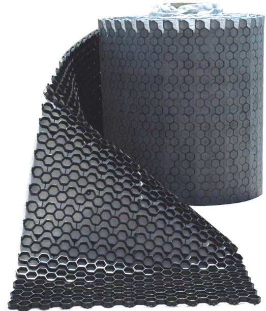
EZRoll™ Gravel Paver with geotextile fabric backing.