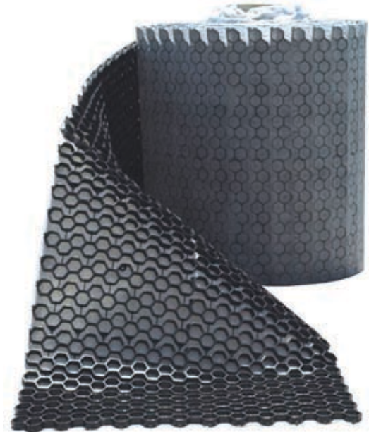
EZRoll™ Gravel Paver with geotextile fabric backing.