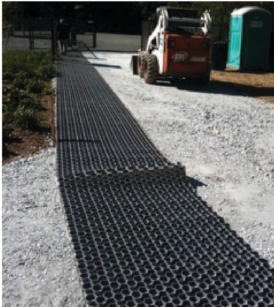
Installation at the Newark Street Dog Park