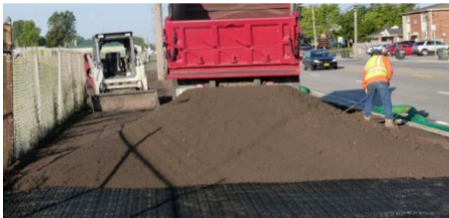
Covering EZ Roll with soil just before installing sod. Hydro-seeding is an alternative method to vegetate an installation.