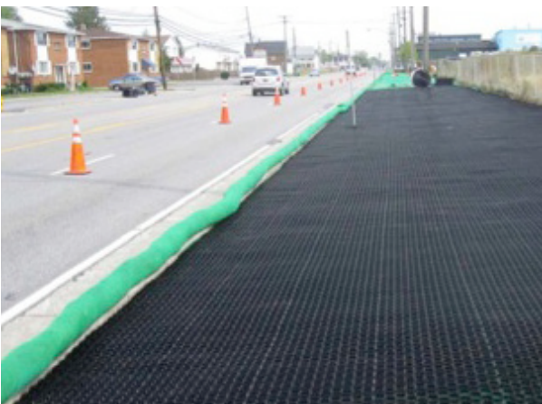
EZ Roll Permeable Paver installed and ready to be covered with soil and sod.