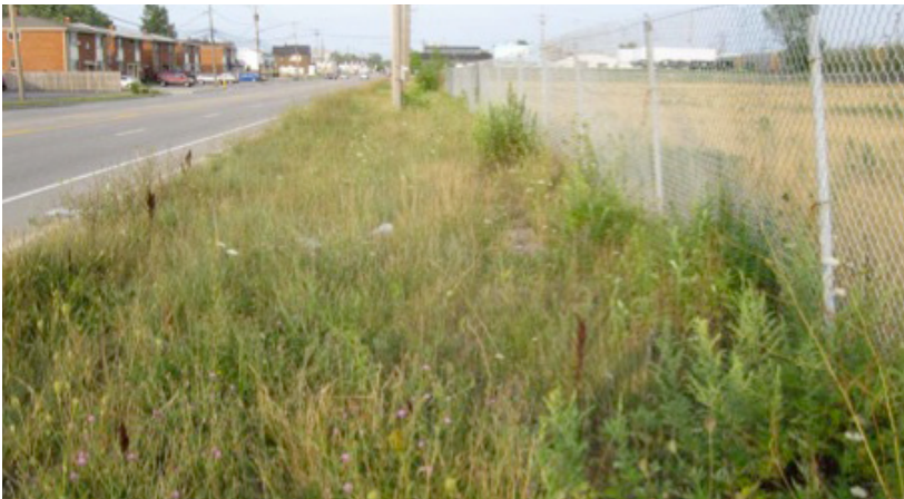
Contaminated soil requiring containment in Depew, New York.

The general contractor stated, “Advanced GeoServices identified an innovative capping technology [for the contaminated soil] using EZ Roll Permeable Paver as a primary component. They efficiently implemented the design while working with New York DOT and EPA to gain approval and complete the installation.”