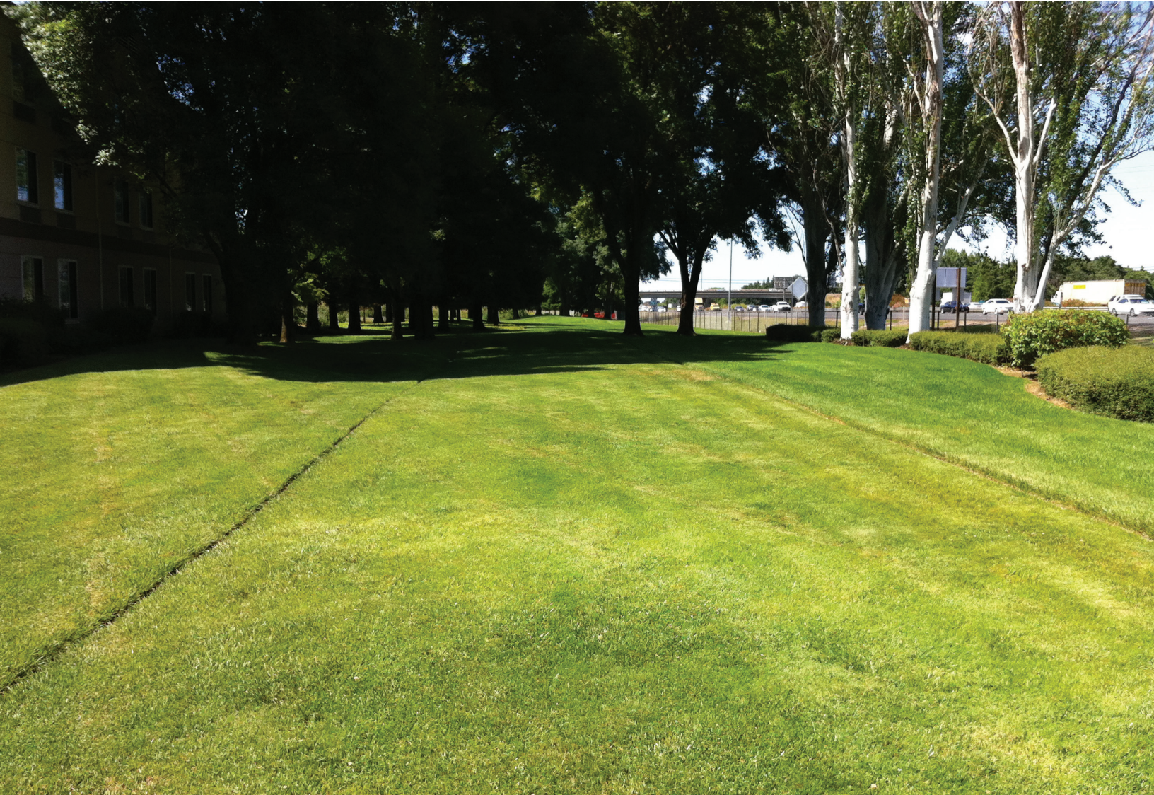
Above Right: Installation of TuffTrack Pavers in 1999 Above: The job site revisited in June 2011