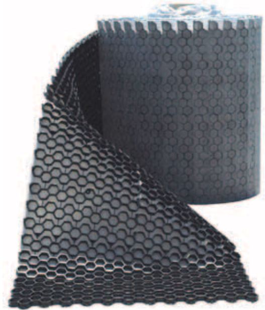
EZRoll™ Gravel Paver with geotextile fabric backing.