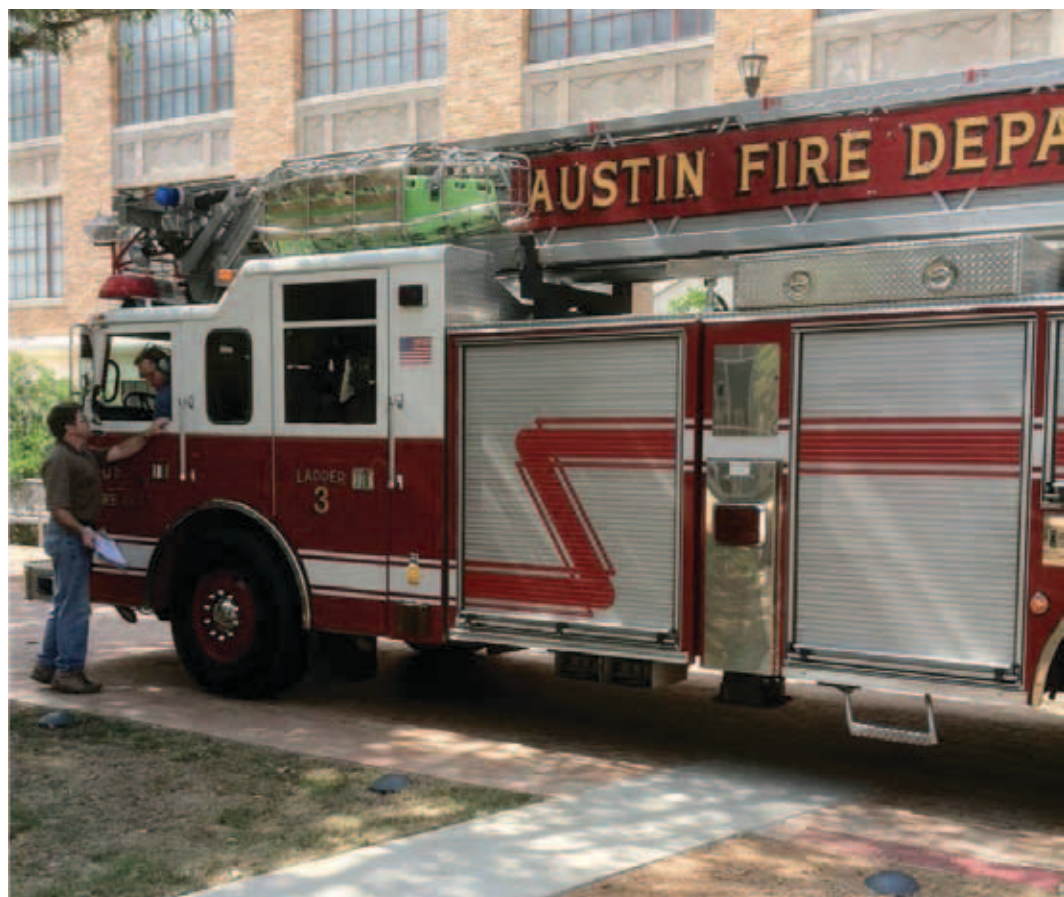
Above Right: Installed Paver. Above: Fire Lane Test on EZ Roll Gravel Paver.