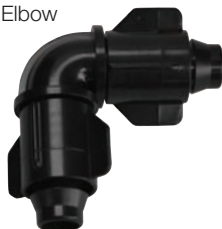
CEL 18: Elbow