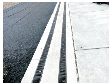
Handles heavy sheet flow