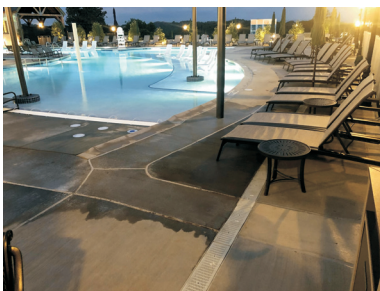
Flexibility for Perimeter drainage