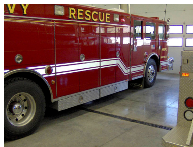
Engineered for heavy loads