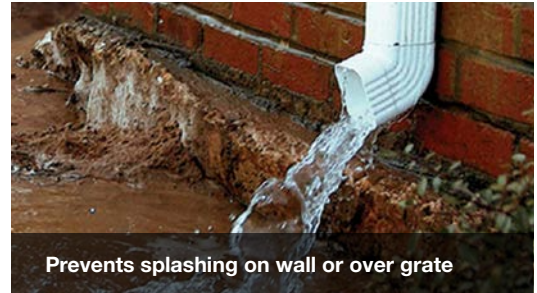
Prevents splashing on wall or over grate