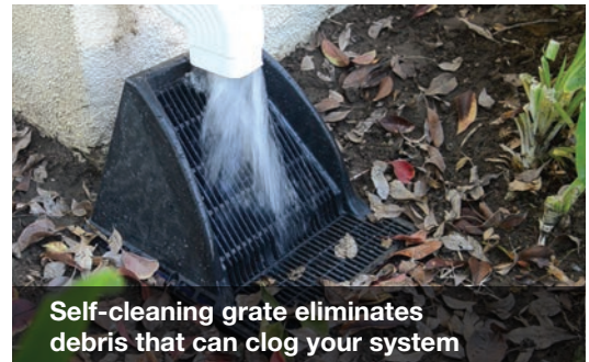
Self-cleaning grate eliminates debris that can clog your system