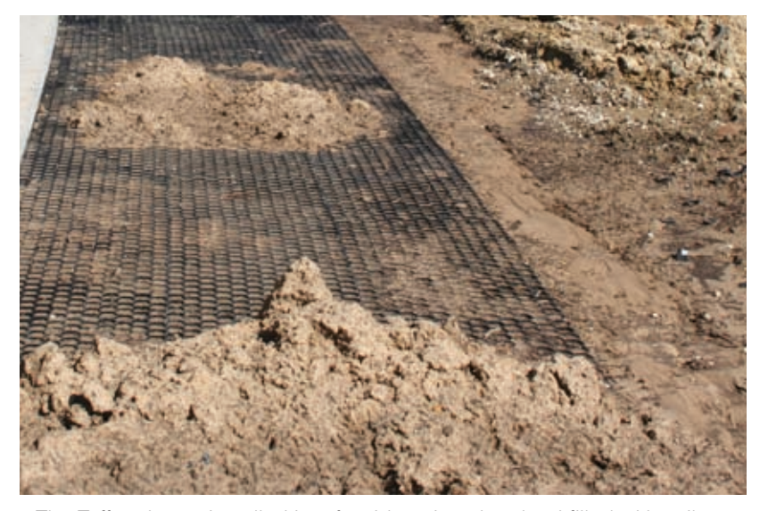
The Tufftrack was installed in 6 ft. wide strips, then backfilled with soil.