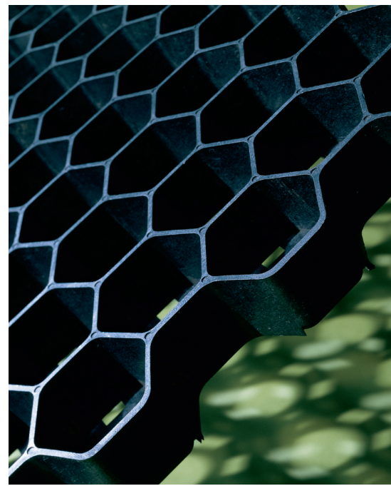
Tufftrack® Grassroad Pavers are the strongest in the industry, with a comprehensive strength of 98,770 psf when cells are empty.