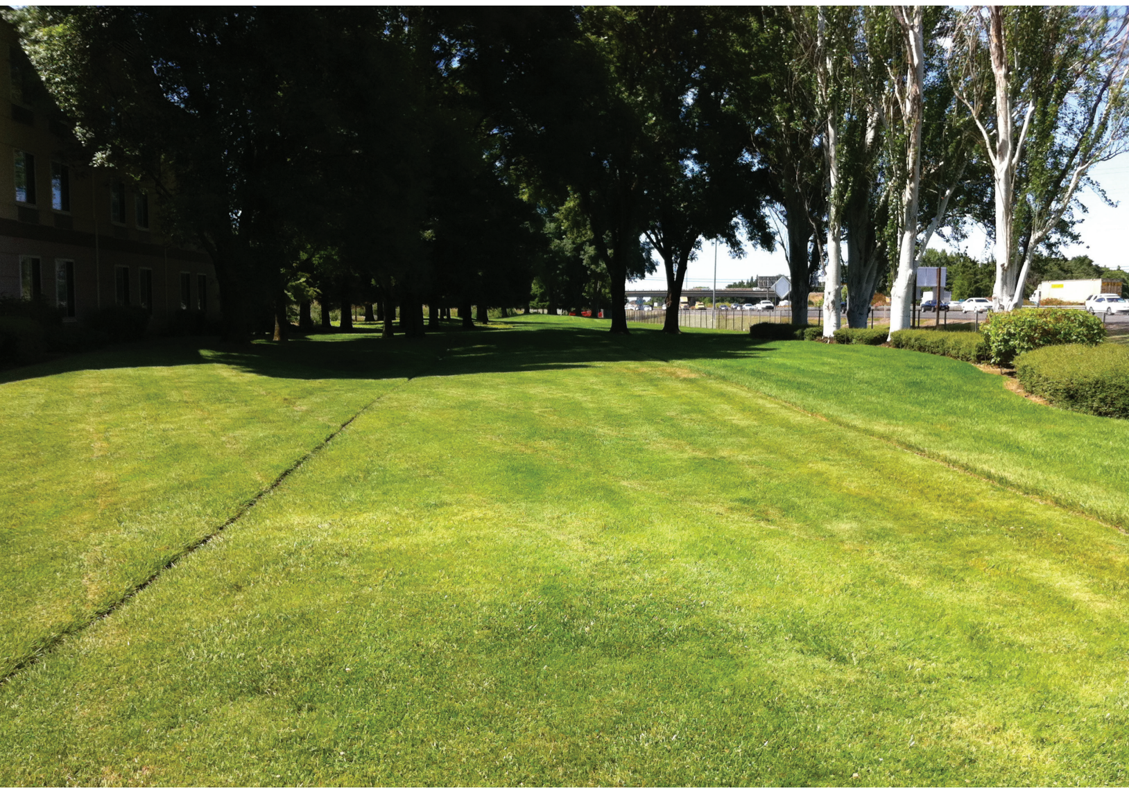
Above Right: Installation of TuffTrack Pavers in 1999 Above: The job site revisited in June 2011