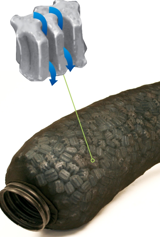
EZflow poly-rock aggregate is engineered with "flow channels" to increase void space.