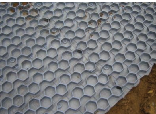
EZ Roll Gravel Paver unrolled at the jobsite.

The finished lot with gravel fill is utilized daily as one of the primary parking zones at the institute.