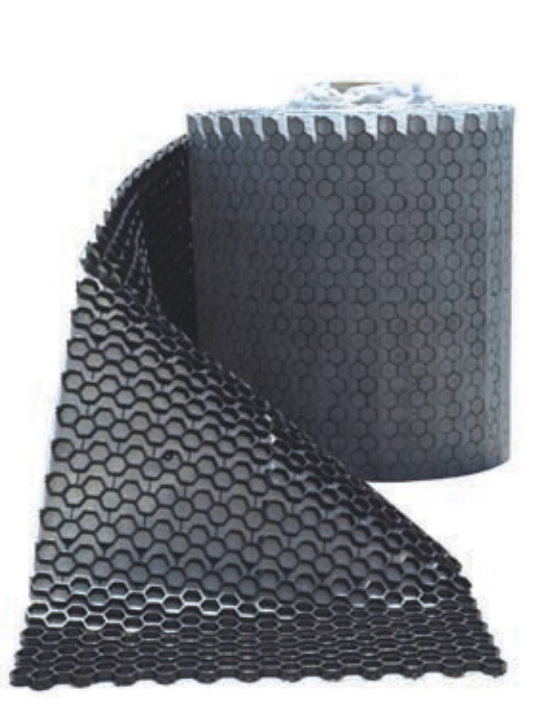
EZRoll<sup>™</sup> Gravel Paver with geotextile fabric backing.