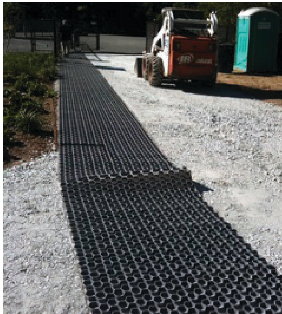
Installation at the Newark Street Dog Park