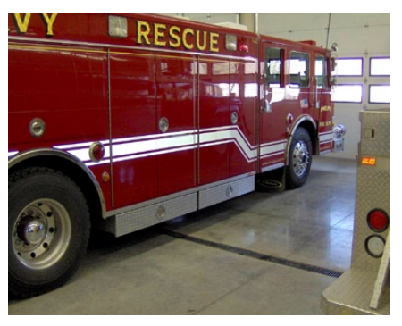
Durable system engineered for heavy loads