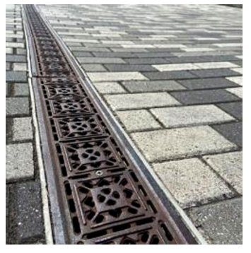
Grates available in a variety of materials and styles