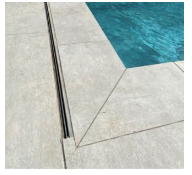
Slot tops showcase a low-profile aesthetic