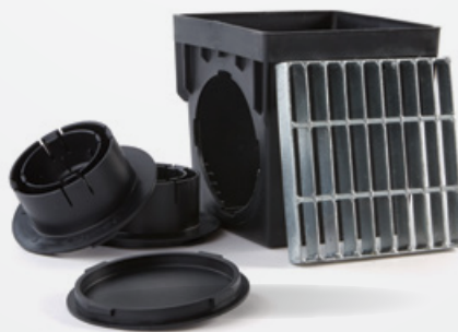
900MTLKIT 9" Catch Basin Kit