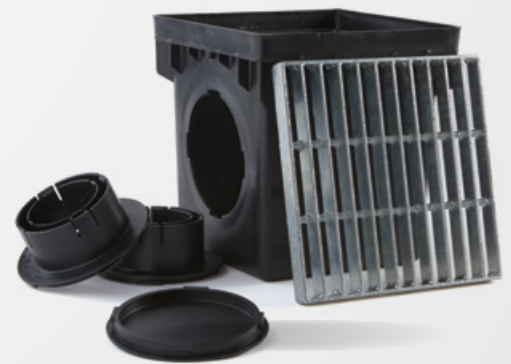
1200MTLKIT 12" Catch Basin Kit