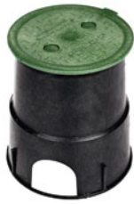
▲ Manufacturer B