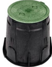
▲ Manufacturer C