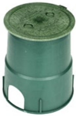
▲ Manufacturer A